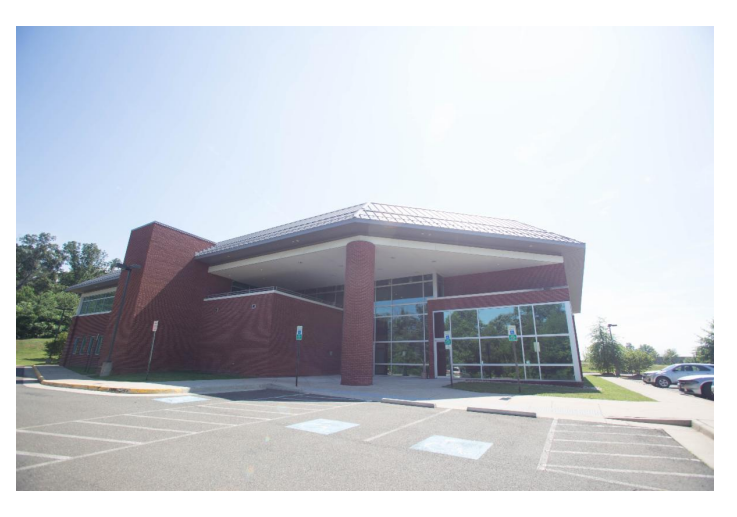
FOR LEASE: $22.50 per square foot

its nearly 8,000 students the region's only integrated math and science curriculum, a nationally acclaimed arts program and Career Technical Education (CTE).