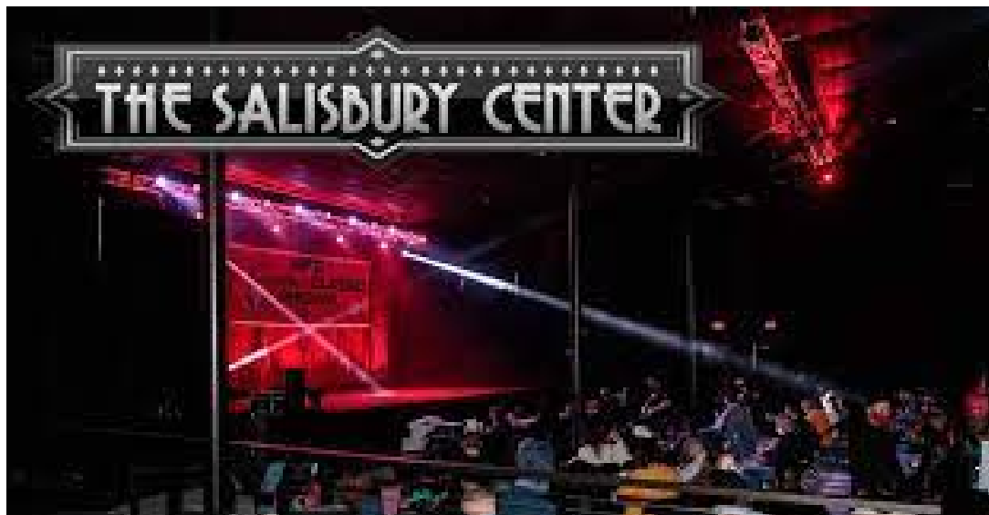
The Salisbury Center